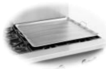
LOG4 (lift off griddle)